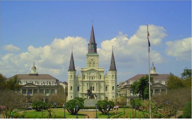
St. Louis Cathedral, across Jackson Square, New Orleans

Governor Claiborne helped to shape the city of New Orleans, which is a national treasure, with its own distinct heritage. It is the only city in the United States that can lay claim to its own music, its own food, its own language and its own architecture. Please save the dates of September 29 to October 2, 2011 to join us for the Claiborne Family Reunion. We will tour the city's French