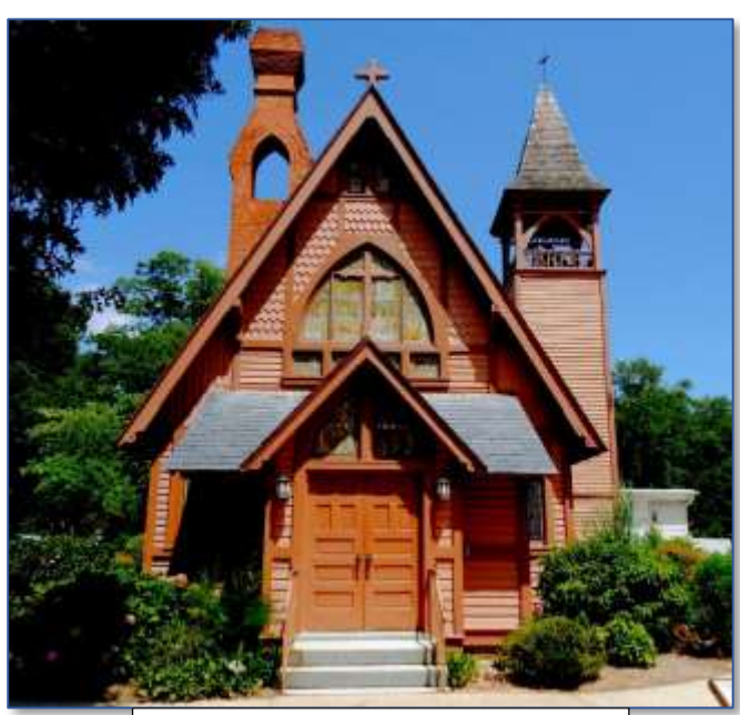
Historic 1880 Christ Church Stevensville