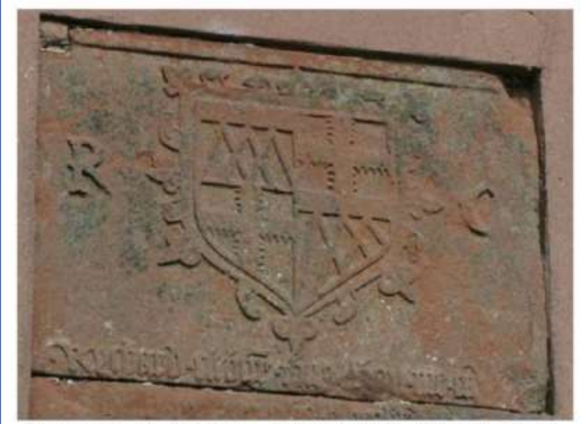
Arms and Inscription, Cliburn Hall, Westmorland

No one knows when the old stone peel tower at Cliburn was first built, but it would have been preceded by an even more ancient wooden structure, palisade and moat.