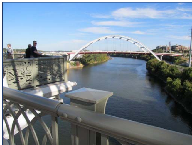
Cumberland River view

Who knew that just off the bridge on 3rd Avenue South was The Johnny Cash Museum? It was a worthy museum with 32 themed displays: his time in the Air Force, with the Carter Family, the Prison Shows, the 1960s, and more. We had to rush to the hotel to get ready for the Banquet.