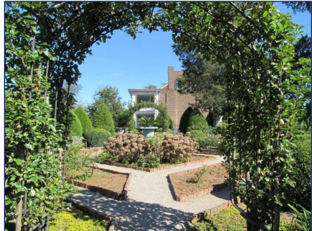
Formal garden at Carnton, hydrangeas and urn