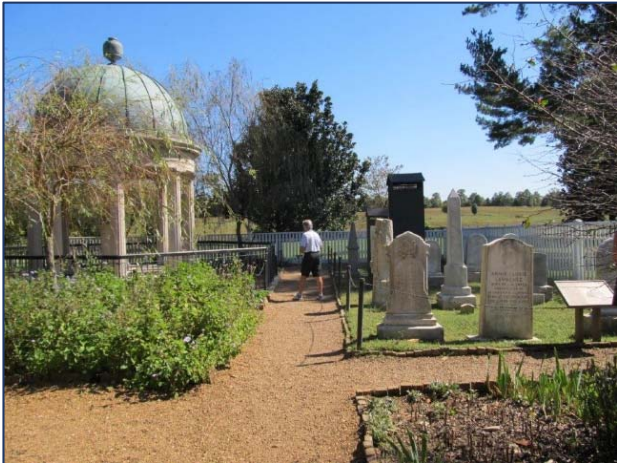
Burial plots of the Andrew Jackson family