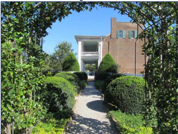
Garden arch showing side view of Carnton