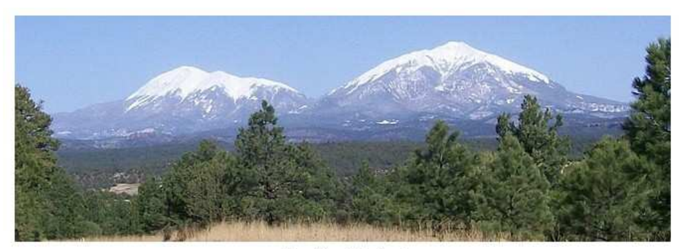
The Spanish Peaks looking west from Aguilar, Colorado

This was the time of "Open Range". The way this worked all ranchers grazed their cattle together. Each rancher had his own identifying brand. At roundup time the cattle that were ready were shipped to market in Denver. There the cattle were sold, the brand recorded at the stockyards, and a check was sent to the owner of the brands sold. A rancher need not have been the shipper to receive credit for his stock. Any stock going through the stock yard without a bill of sale to the contrary, the check was cut for the brand holder. All brands were registered by the state.